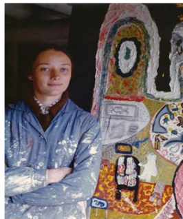
Niki de Saint Phalle