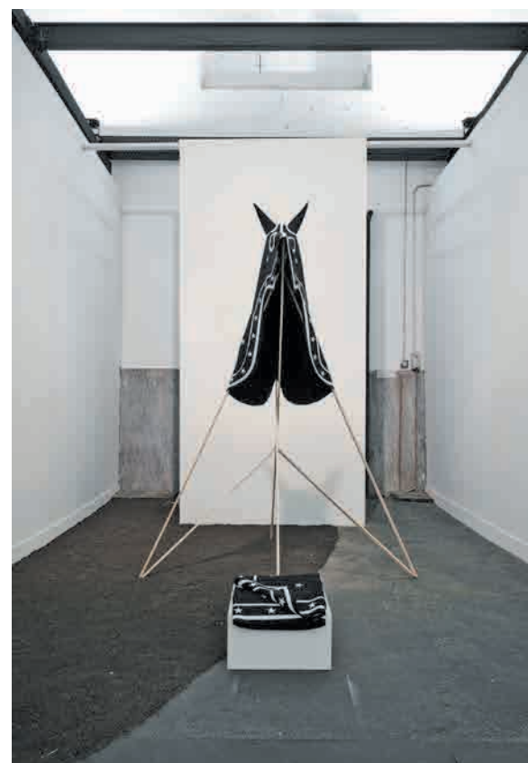
Starship , 2013 Equestrian adornments and battens View of the exhibition Jusqu'ici tout va bien , MACRO Testaccio, 2017

During the exhibition, the artist will intermittently project a luminous message in the skies above Nice, transported by a hovering drone.