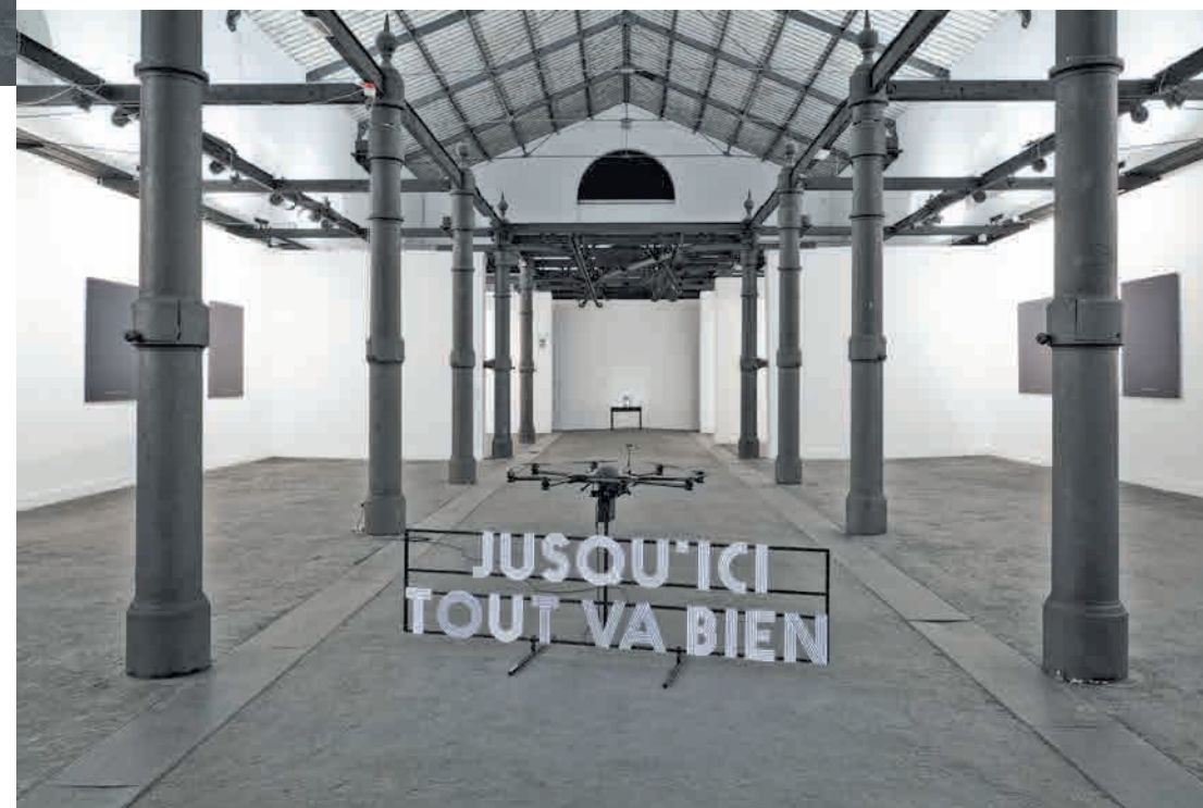
« Jusqu'ici tout va bien », 2017 Drone and illuminated emblem View of the exhibition at the MACRO Testaccio

Invited in May 2016 by the MAMAC for European Museum Night, the artist installed a thousand candles reproducing the starry sky of 17 May 2114, on the esplanade between the MAMAC and the Théâtre National de Nice. Lit during the course of the evening, the candles gradually created this future constellation, revealing the invisible and creating numerous symbols in the face of an imagined future. This solo exhibition in the contemporary gallery allows this experience to be continued and helps to reshape the exhibition as the space and time for a deep connection between the museum and its public.